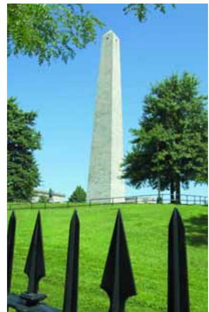
Bunker Hill Monument

Back Bay Coach operates a shared van service from the airport to many Boston hotels. (617) 746-9909