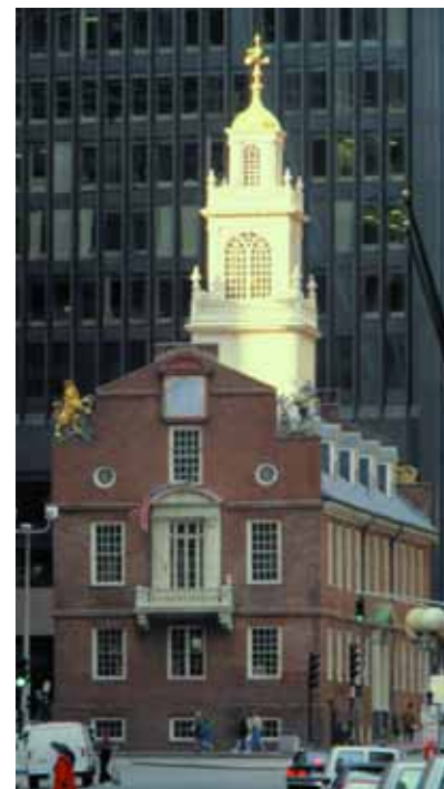
Old State House