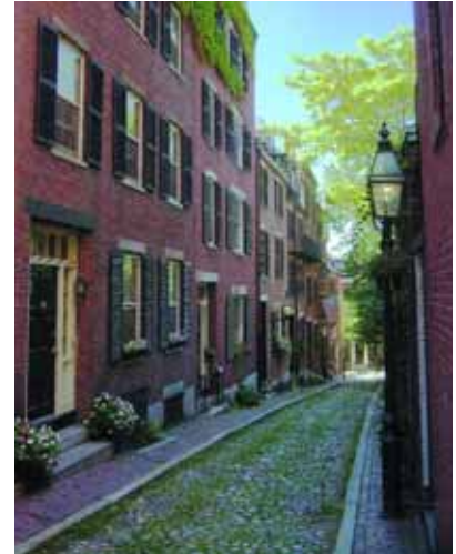
Beacon Hill Street

For more information on Boston visit: www.bostonusa.com